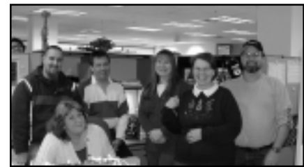
CITY OF BELLEVUE EMPLOYEES made holiday wishes come true this past holiday season